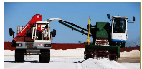
Pilot Scale Trials Complete with More Than 10,000 Tonnes of Salts Produced