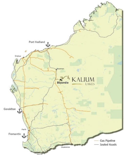
Strategic Location Close to Gas Pipeline, Sealed Roads and Ports